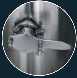
Inox tap of 2" 1/2 removable for cleaning