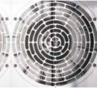
optimal air flow