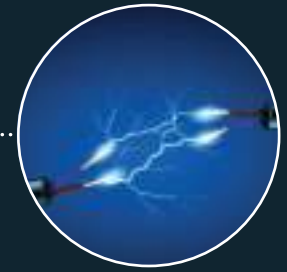
Software Protection - in case of power drop the program will continue to execute cycle since stop