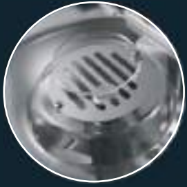
Bowl guard of transparent plexiglass with ventilation grid