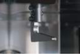
hook turning system