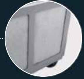
Dust filter for refrigeration unit