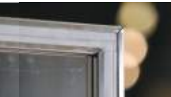
built-in door gaskets mounted on the door