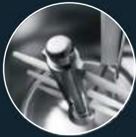
Removable mixing tool with scraper