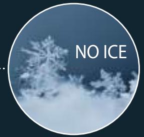
Bowl inside wall with de-icing system